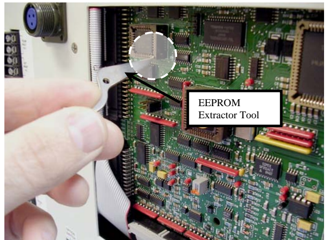
Replacing the EEPROM on a BAM-1020