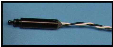
80957 AMBIENT TEMP SENSOR