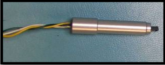
9278-1 FILTER RH SENSOR