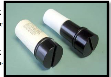
8913 SAMPLE PUMP FILTER HOLDER