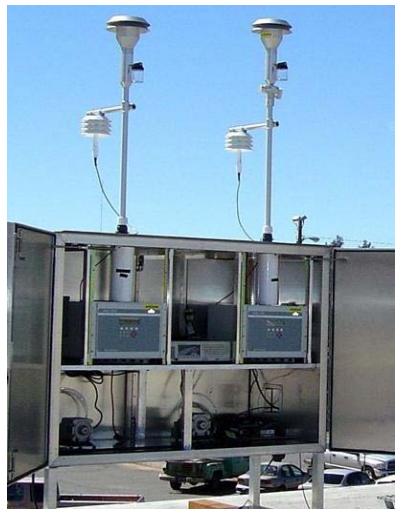
Optional BX-906 Dual-Unit Shelter