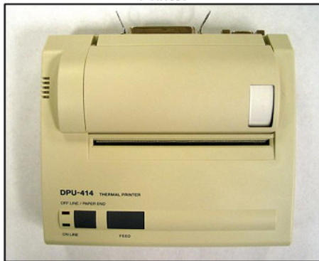
MOI P/N: G3115