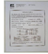
Calibration Certificate AEROCET 531S-9600