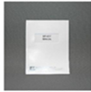
Manual AEROCET 531S-9800