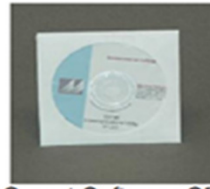
Comet Software CD P/N 80248