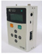
AEROCET 531S P/N AEROCET 531S