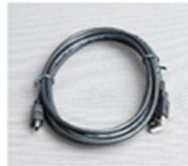
USB Cable P/N 500787