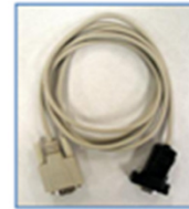
Custom Serial Cable P/N 3228