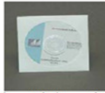
Comet Software CD P/N 80248