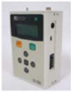
GT-526S P/N GT-526S