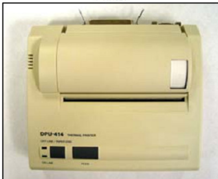
MOI P/N: G3115