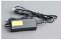
Battery Charger P/N 390031