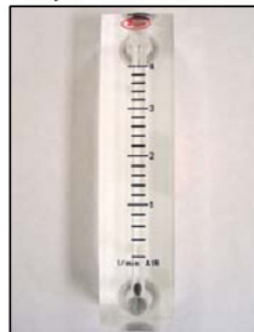
MOI P/N: 9801