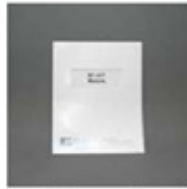
Manual P/N GT-526S-9800