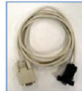
Custom Serial Cable P/N 3228