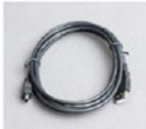
USB Cable P/N 500787