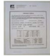
Calibration Certificate P/N GT-526S-9600