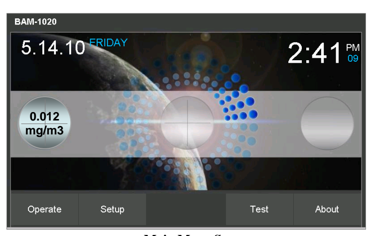
Main Menu Screen

The BX-970 option is recommended for locations where the basic BAM-1020 display is difficult to see, and for users who frequently navigate the menu system to change or adjust operational settings.