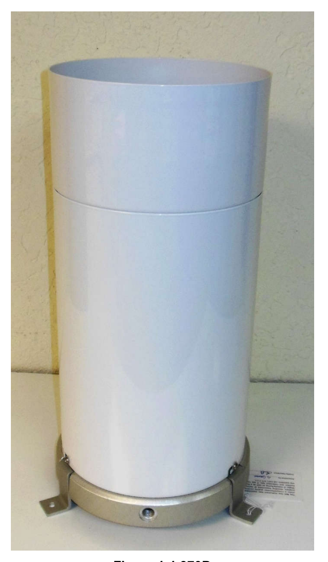
Figure 1-1 370D

The Model 370D and 372D Tipping Bucket Rain Gauges are virtually the same. The primary difference between them is that the 370D can have multiple calibration rates whereas the 372D is calibrated specifically for 0.5 mm of rainfall per tip. For simplicity, the rest of this manual will only reference model number 370D, except where notable differences occur.