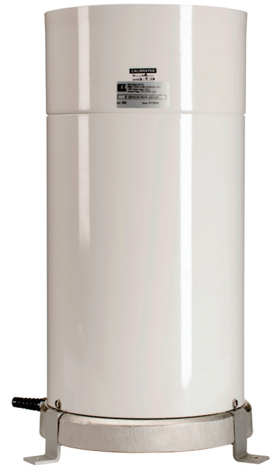
370D Precipitation Gauge