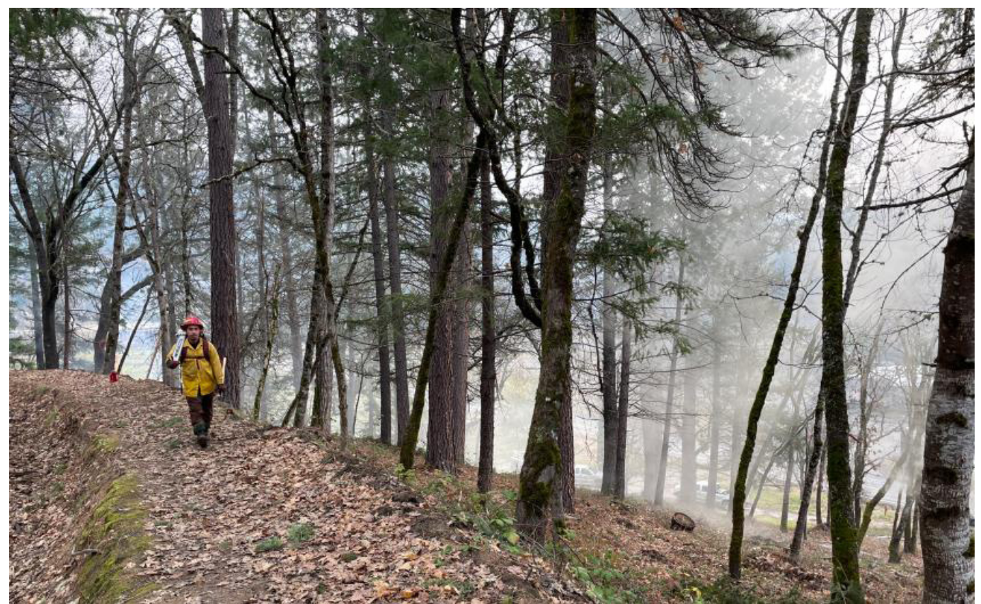
Prescribed Burn Site, February 8, 2023.

Each attendee was able to see in near real time updates in the meteorological and air quality data as the environmental conditions were changing including wind shifts.