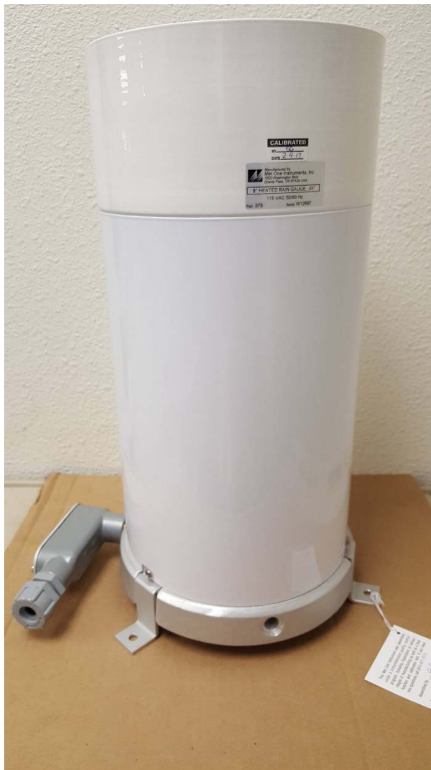
Figure 1-1 375D

This series of rain gauges contains heating elements inside the sensor to prevent the tipping bucket freezing in place and to melt snowfall. This allows the gauges to be used to monitor precipitation year-round in locations that fall below freezing.